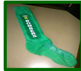
Tube Style Socks: $20.00 (Currently available)